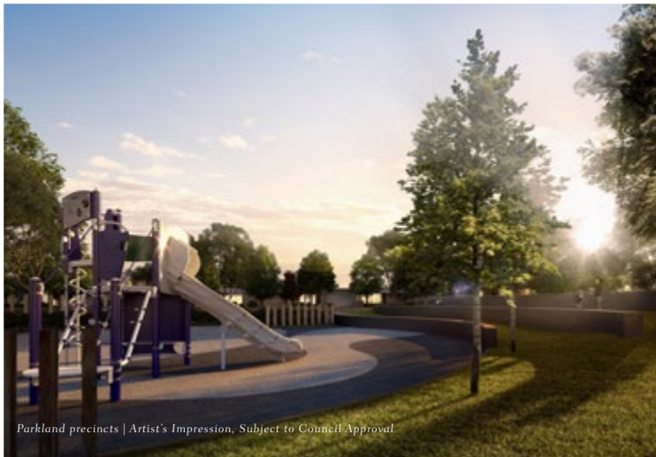
Parkland precincts | Artist's Impression, Subject to Council Approval