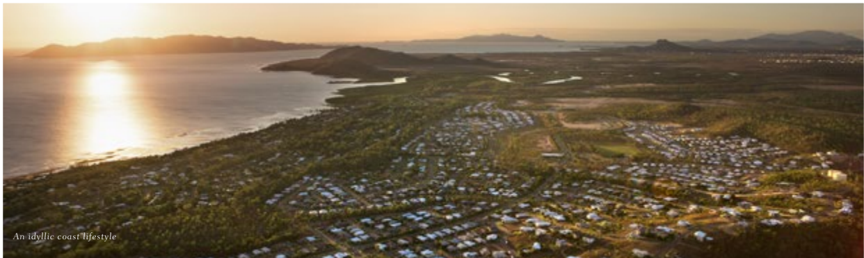
An idyllic coast lifestyle

At Bayside at Bushland Beach, thoughtful master planning means home sites offer unsurpassed choice to suit your life and style – extra-large or conveniently compact, level or gently undulating. The master plan also incorporates changing elevations, maximising the wide ocean views, as well as views to the Townsville CBD and west to the Pinnacles. Best of all, you're free to select the professional builder whose ability and experience will bring your vision to life. Building Covenants and Design Guidelines at Bushland Beach have been created to protect your investment and uphold the high standards of home design and presentation Bushland Beach is renowned for.