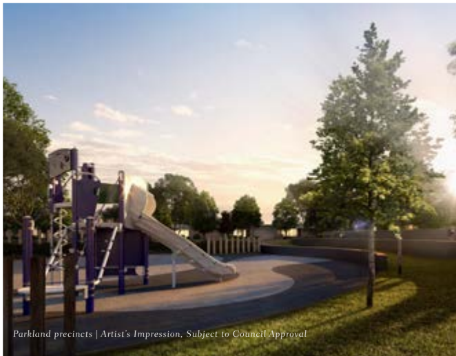
Parkland precincts | Artist's Impression, Subject to Council Approval