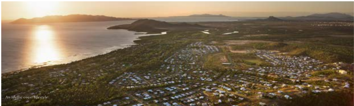
An idyllic coast lifestyle

At Bayside at Bushland Beach, thoughtful master planning means home sites offer unsurpassed choice to suit your life and style – extra-large or conveniently compact, level or gently undulating. The master plan also incorporates changing elevations, maximising the wide ocean views, as well as views to the Townsville CBD and west to the Pinnacles. Best of all, you're free to select the professional builder whose ability and experience will bring your vision to life. Building Covenants and Design Guidelines at Bushland Beach have been created to protect your investment and uphold the high standards of home design and presentation Bushland Beach is renowned for.