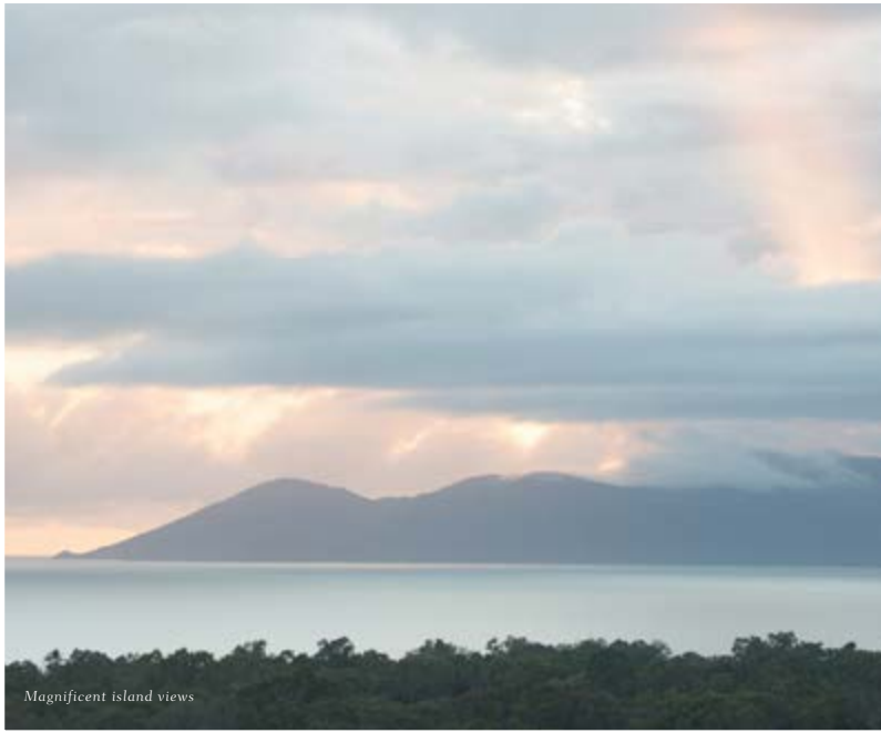
Magnificent island views